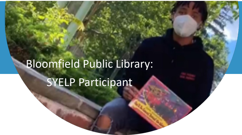
Bloomfield Public Library: SYELP Participant