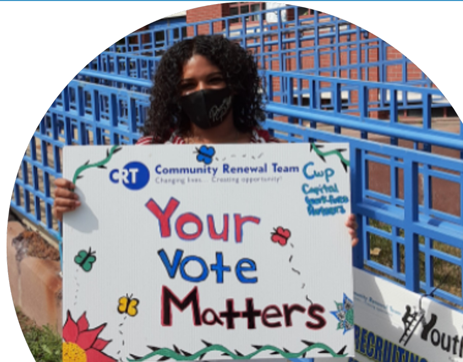
Community Renewal Team: SYELP Participant