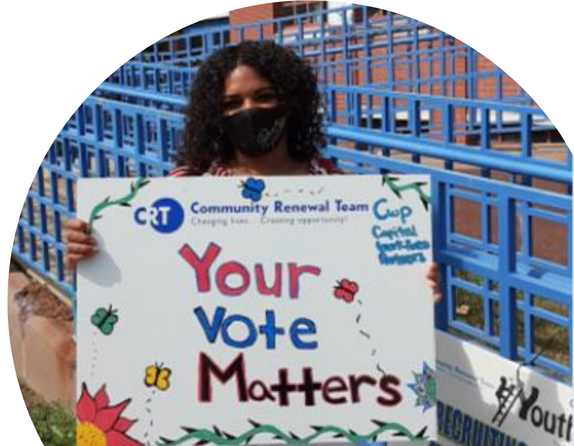
Community Renewal Team: SYELP Participant