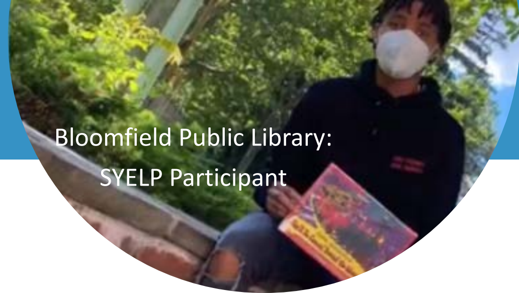
Bloomfield Public Library: SYELP Participant