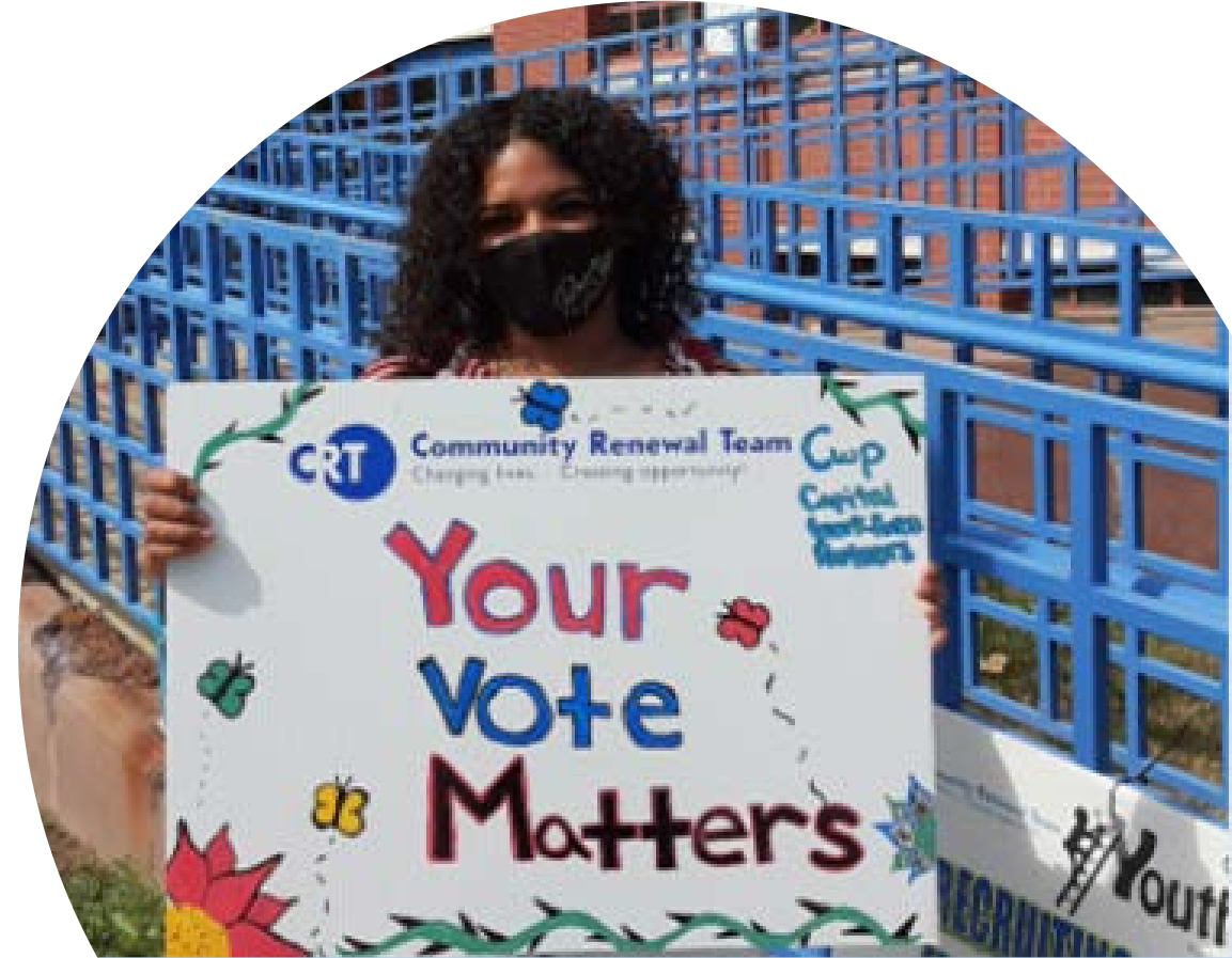
Community Renewal Team: SYELP Participant