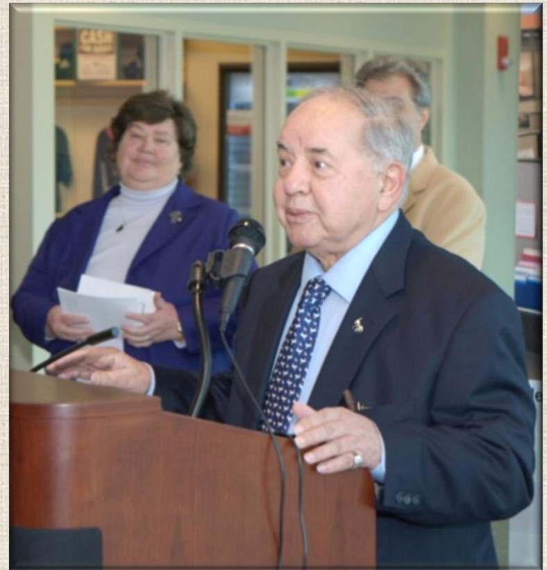
Senator Billy Ciotto

“ The Manufacturing and Engineering Employment and Resource EXPO “