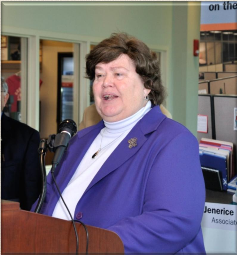
Mayor of East Hartford, Melody A. Currey